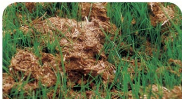
Grass Growing Through Fiber Matrix