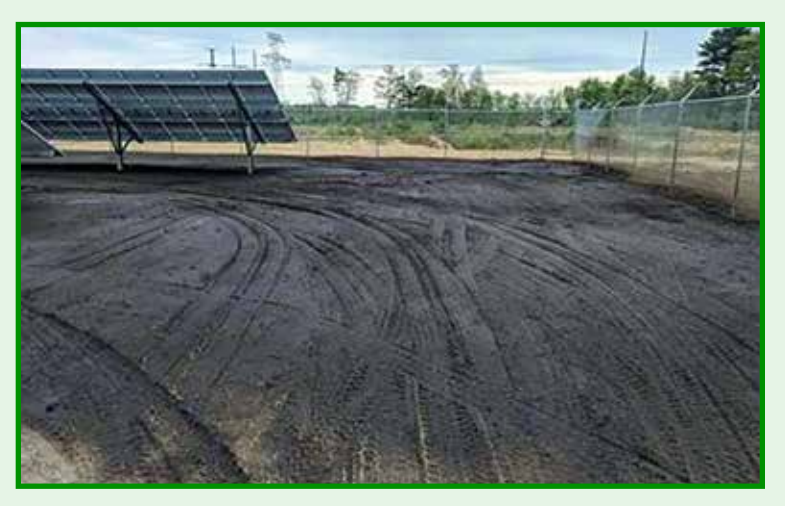
GeoEarth applied 4500 lb./acre